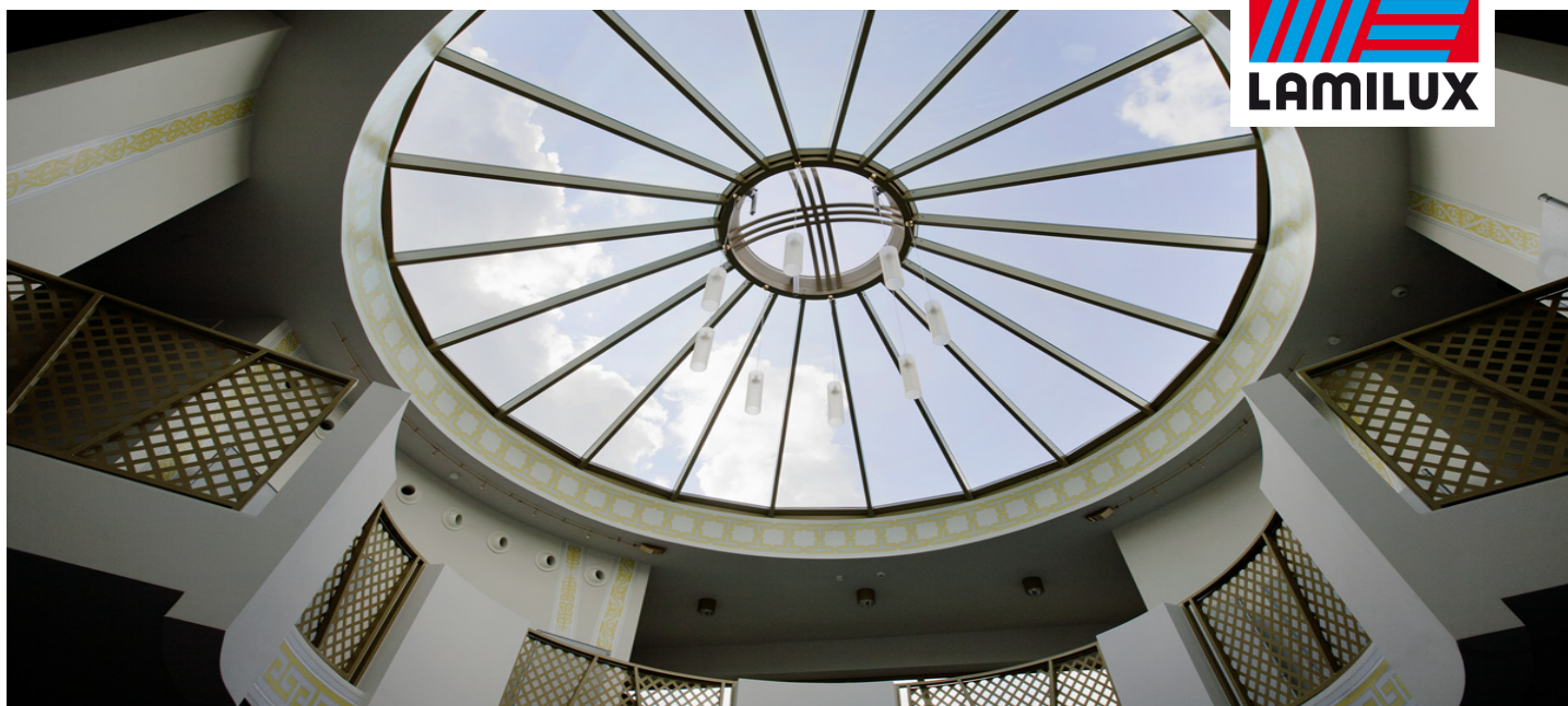
Embassy of Kazakhstan, Berlin