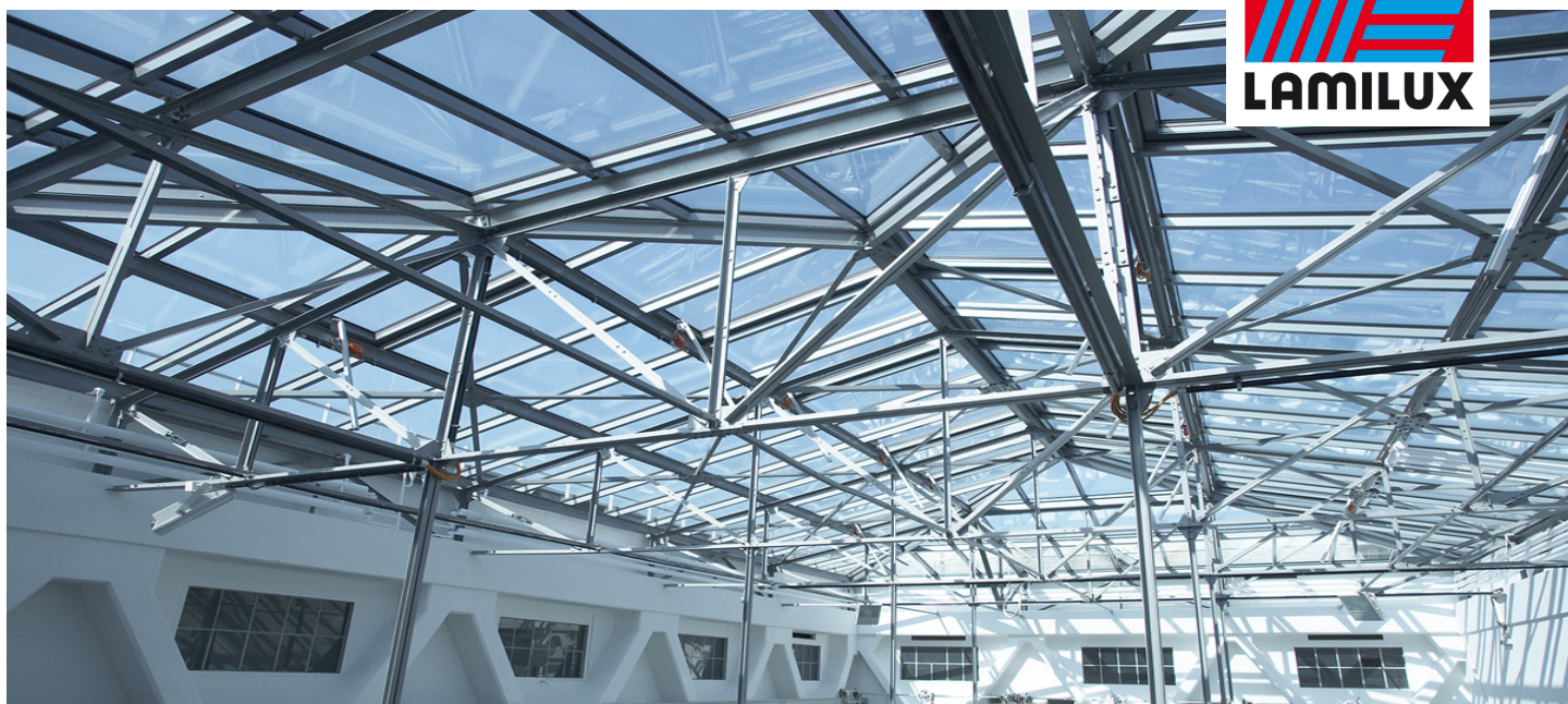
University of Music and Performing Arts, Munich