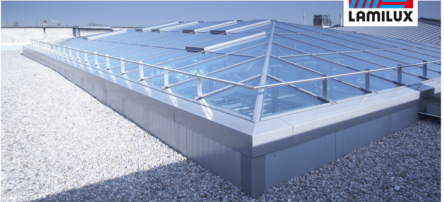
University of Music and Performing Arts, Munich