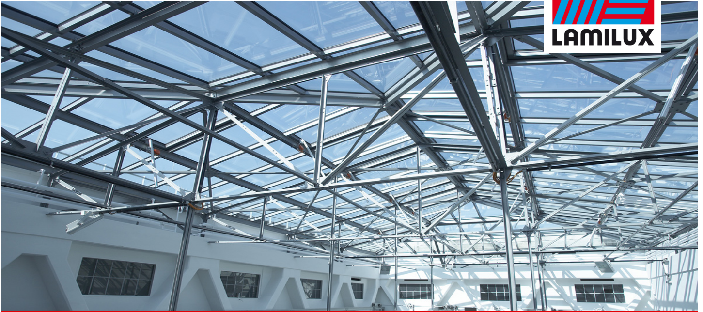
University of Music and Performing Arts, Munich