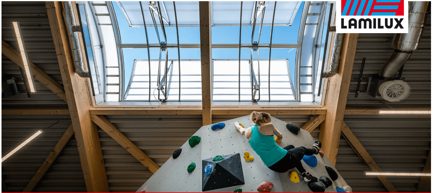
Climbing Centre OWL, Brakel