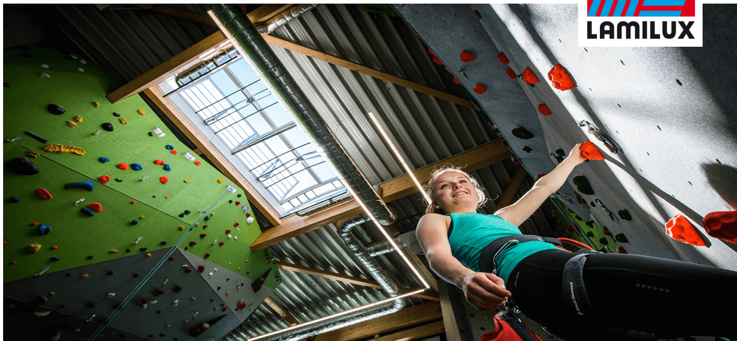
Climbing Centre OWL, Brakel