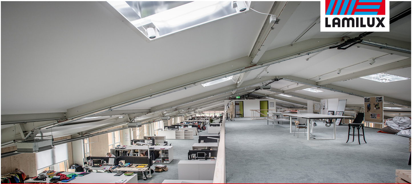
VauDe, Tett nang