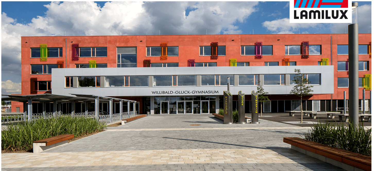
Willibald-Gluck Secondary School, Neumarkt i.d. OPf.